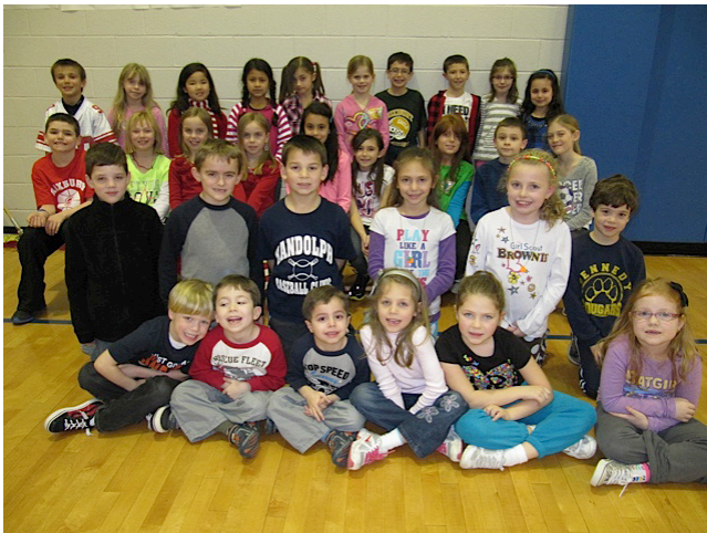
County recognized winners!