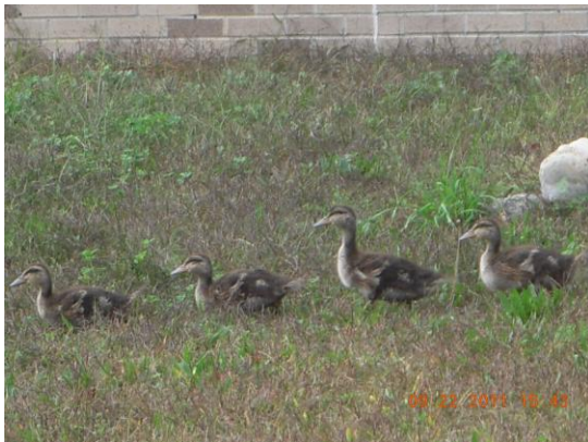
Nixon School's Baby Ducks!