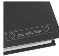
ONE-LINE NAME PLATE WITH TWO MARKS

One line of text engraved on a metal plate with choice of marks.