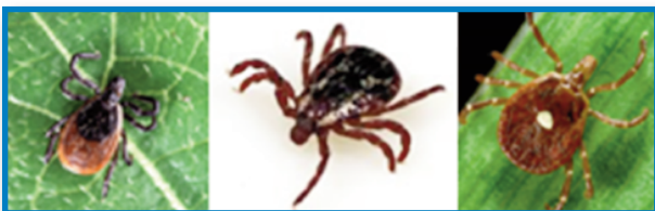
Black-legged “deer” tick